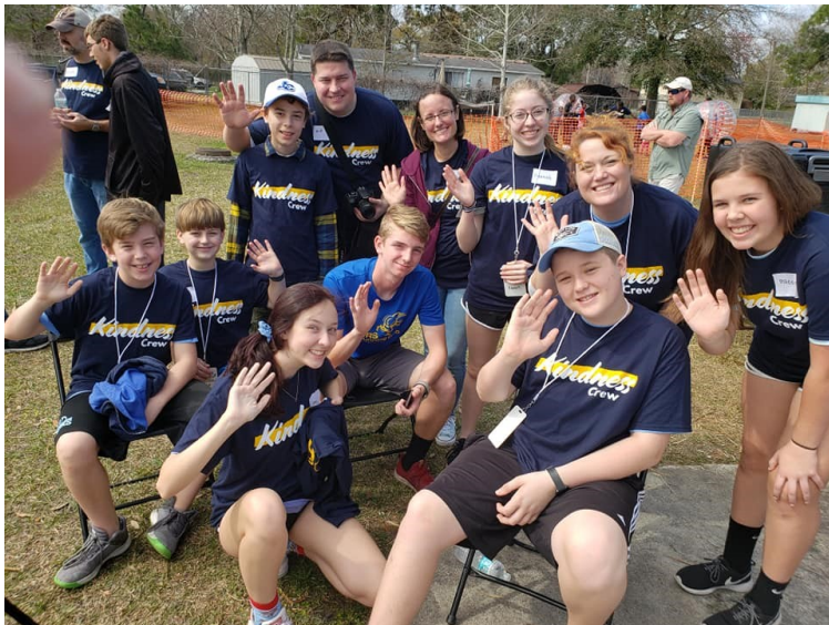
taken at the recent Mission Madness event as our students, along with other CBF Florida youth, worked together to serve our community.

One will be in the narthex and the other in the fellowship hall throughout the month of March. Our hope is to fill all 200 envelopes by the end of March. The money raised will help us cover the costs of the trip, which include airfare, building supplies, transportation, food, housing, and immunizations. We hope you will partner with us in this way to help bring security and stability to a family in need in San Raymundo. In the meantime, continue to pray for our team, for the family we will serve, and for ministry of Casas por Cristo. Thank you!