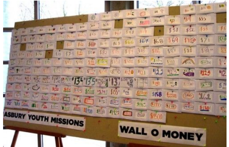
Photo: example of Money Wall

One way you can help is by participating in our Wall of Money fundraiser. What is the Wall of Money? Well, it is what its name suggests: It is a wall of money. The issue, however, is there is no money on the wall initially. On the wall are numbered envelopes, which contain instructions. You take a numbered envelope off the wall, and whatever number is on the front of the envelope is the amount of money you place inside. For example, if you take an envelope numbered 73, you will place $73 in the envelope and place it in the collection box. There will be 200 numbered envelopes that will be on two separate walls.