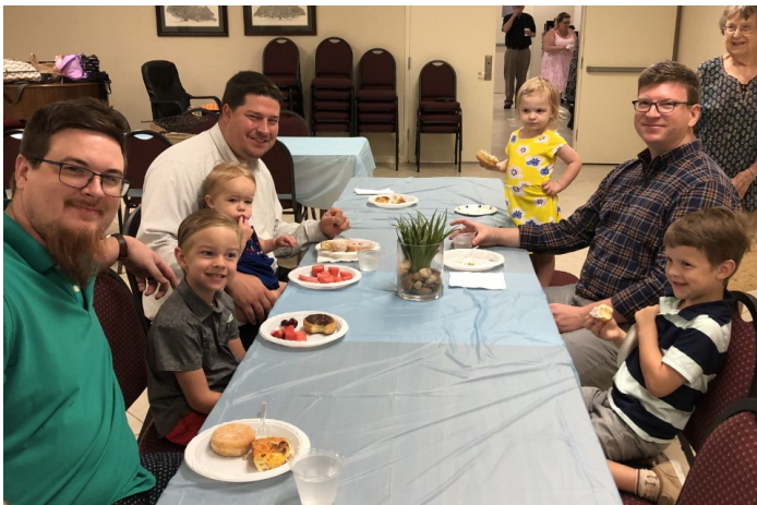
photos from Donuts with Dads

I still need a couple of Sunday morning volunteers. Just 15 minutes of your time prior to worship is all it takes. Please email me at babjc@comcast.net , or call me (see directory) if you are able to do this once every two months. This summer is a good time to rest, relax, and read!