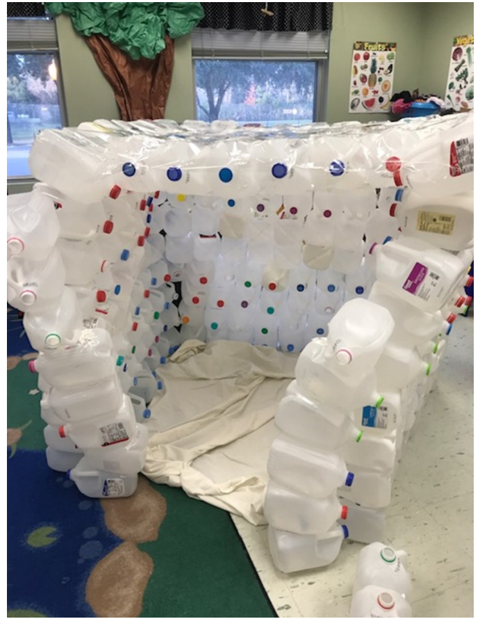
Our miraculous igloo made with no ice!

There is so much to be proud of with Little Friends, not the least of which is our excellent curriculum and our 94% readiness-for-kindergarten rate. We have a daycare and a preschool full of eager learners!