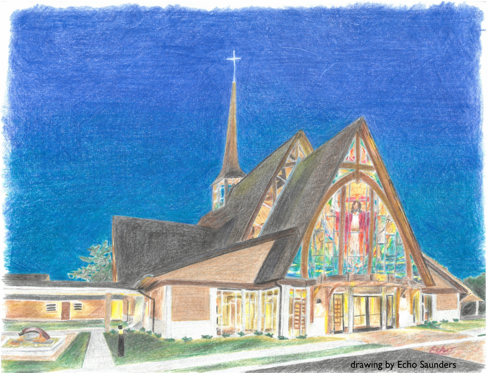
drawing by Echo Saunders