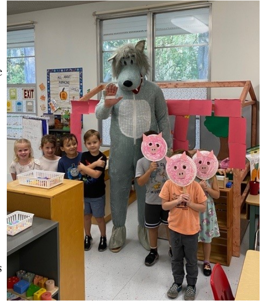
Little Friends acted out the story of "The Three Little Pigs." Hmmm...I wonder who played the part of the big bad wolf?

This holiday season, what do you hope for? Do you hope to be cured from a disease? Do you hope to receive forgiveness from a past friend or family member? Do you hope your kids will come home for Christmas? I pray that as we continue our journey, you may find the joy that Christ brings and long for the hope that brings a smile.