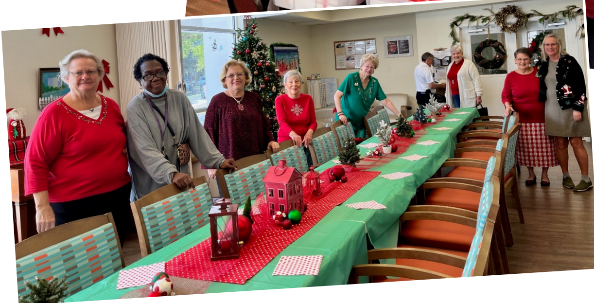
Serving a Christmas luncheon at the Towers