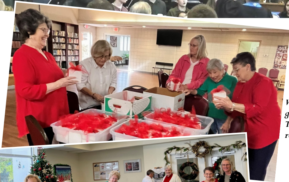
Wrapping gifts for Towers residents