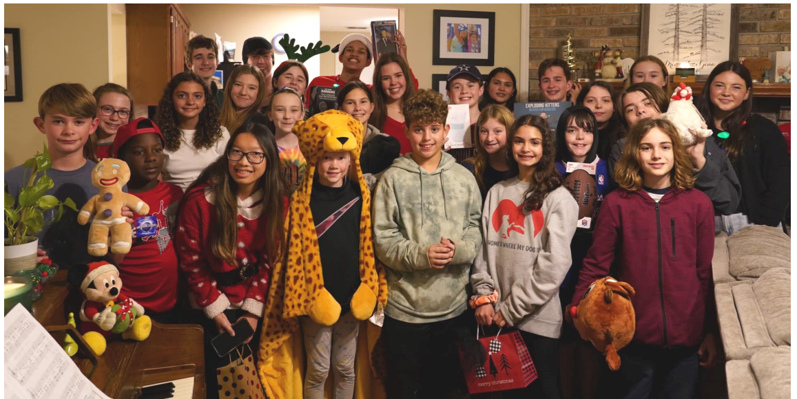
Youth Christmas party

Remember and weep. Remember and resolve to embrace lessons learned, to cherish wisdom found, and to share grace freely given and received. Remember to remember. Who knows? Maybe you’ll discover you’re already more than enough.